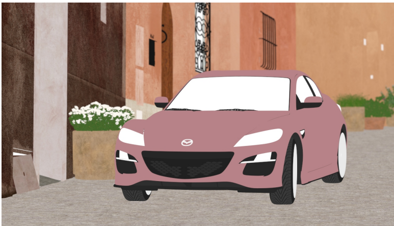
Figure 3.3 – Example albedo image obtained using the first hit. Note that the albedos of all transparent surfaces are 1.

The albedo image is the feature image that usually provides the biggest quality improvement. It should contain the approximate color of the surfaces independent of illumination and viewing angle.