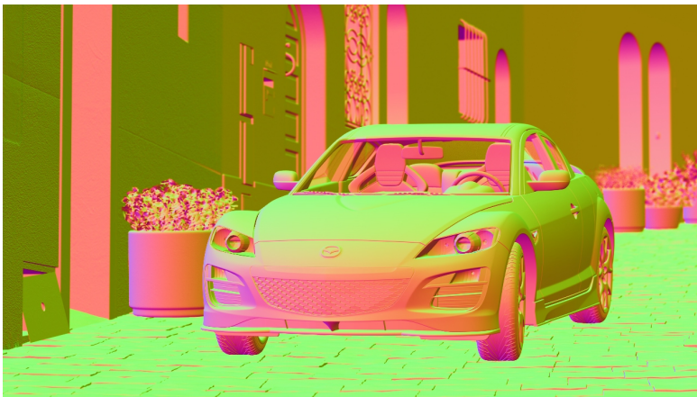
Figure 3.6 – Example normal image obtained using the first diffuse or glossy (non-delta) hit. Note that the normals of perfect specular (delta) transparent surfaces are computed as the Fresnel blend of the reflected and transmitted normals.