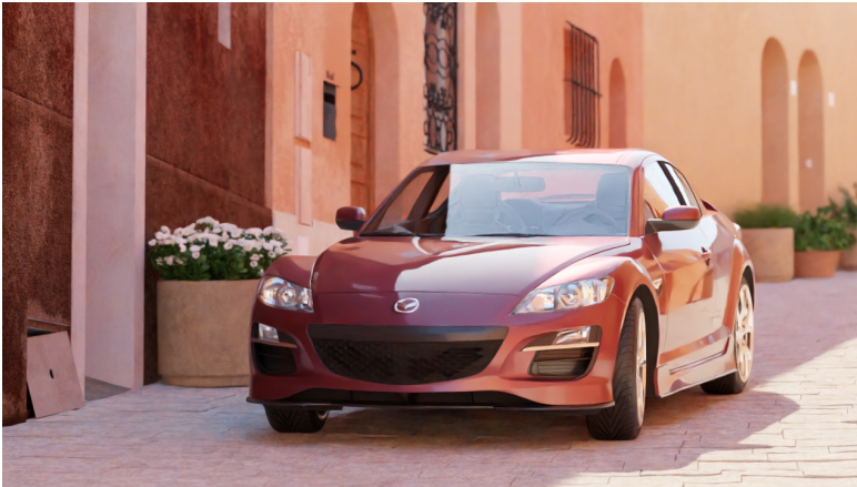
Figure 3.2 – Example output beauty image denoised using prefiltered auxiliary feature images (albedo and normal) too.

neural network (CNN), and it aims to provide a good balance between denoising performance and quality. The filter comes with a set of pre-trained CNN models that work well with a wide range of ray tracing based renderers and noise levels.