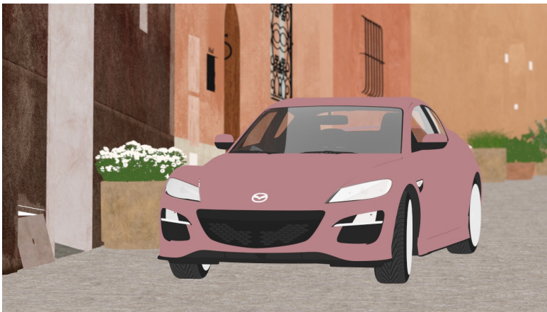
Figure 3.4 – Example albedo image obtained using the first diffuse or glossy (non-delta) hit. Note that the albedos of perfect specular (delta) transparent surfaces are computed as the Fresnel blend of the reflected and transmitted albedos.